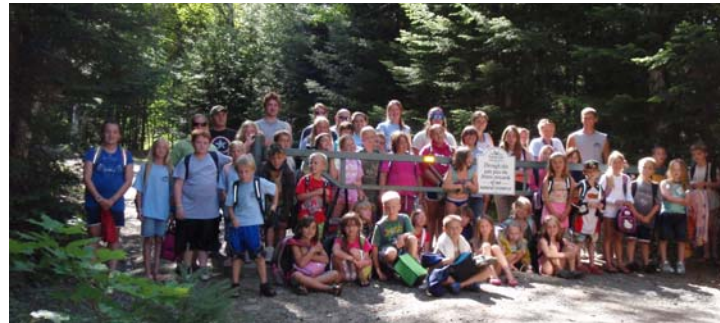
The next generation of stewards of the Rangeley region get ready for a full day of paddling, hiking, swimming, and learning about the natural world we all value and enjoy as participants in EcoVenture's 13th season

I know I speak for the entire RLHT staff team in appreciating the opportunity to be a part of the wonderful accomplishments of this incredible organization. There is no greater privilege than to have meaningful and challenging work which results in lasting benefits to the place we all call home.