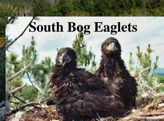
South Bog Eaglets