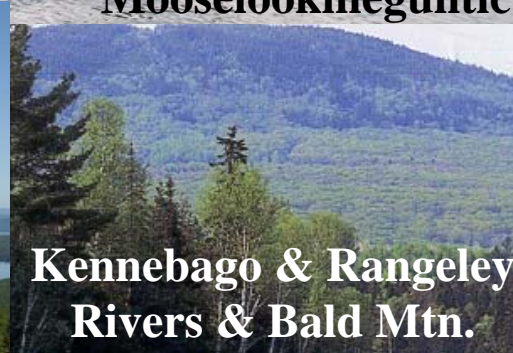
Kennebago & Rangeley Rivers & Bald Mtn.