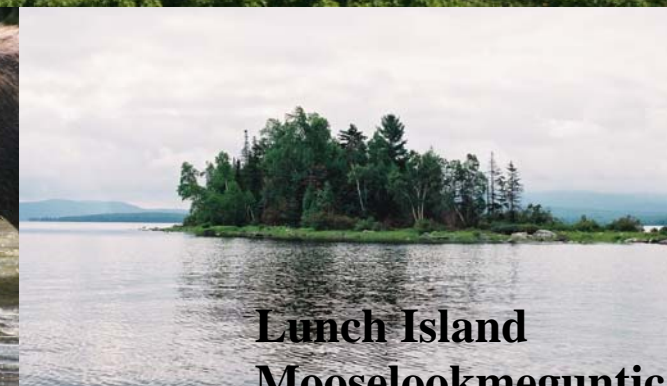
Lunch Island Mooselookmeguntic