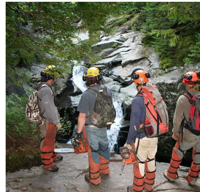
Taking a break to enjoy the scenery!